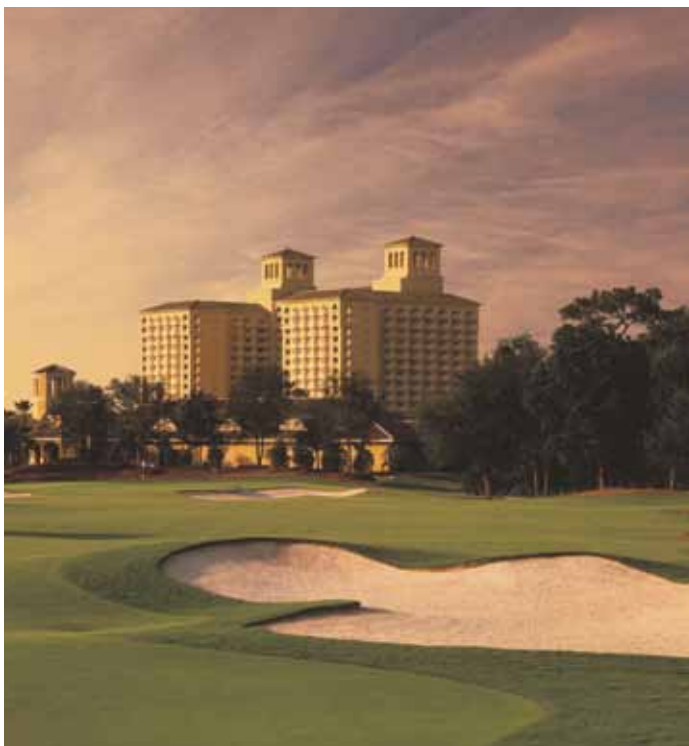
Exhibit Schedule & Networking Opportunities

The exhibits will be 8' x 10' booths and will include one 6' skirted table, two chairs, one waste basket, and one company identification sign. Space is limited, so reserve your booth(s) soon. Booths will be assigned according to the order in which applications (in writing) are received. Once your exhibitor application is received by the FRS, an Exhibitor Packet will be provided.